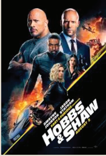
The Fast and the Furious: Hobbs and Shaw Fast & Furious Presents: Hobbs & Shaw